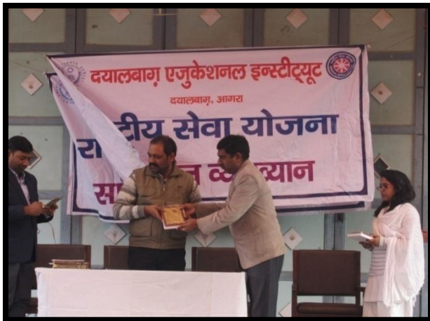
Invited Talk on Implications of GST