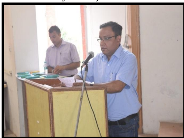
Address by Coordinator, NSS