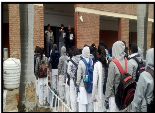
Voters Day Oath Ceremony