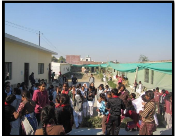
Children Awareness & Chaupal