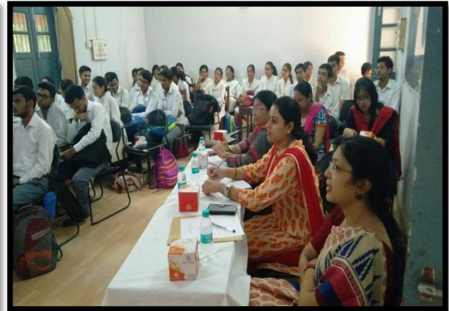
Inter-faculty Speech Competition