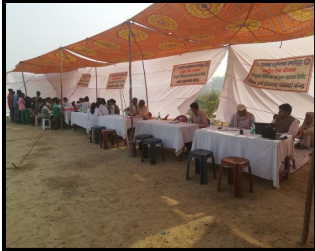
Rural Assistance Services