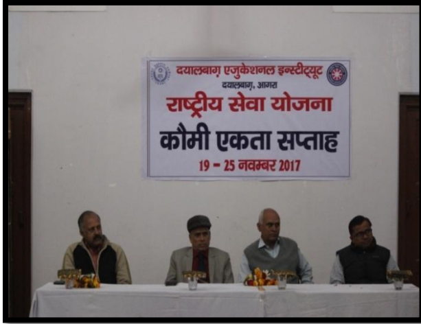
Invited Talk of Sri R.D. Sharma

The NSS wing of the Institute observed National Integration week during 19 - 25 November 2017. During this week NSS Volunteers enthusiastically participated in discussion programs organized in different faculties of the Institute. To enlighten the NSS volunteers of the Institute, the NSS cell of the Institute organized Invited talk of Sri R.D. Sharma, IG (Training), BSF, Mathura on 20 November 2017.