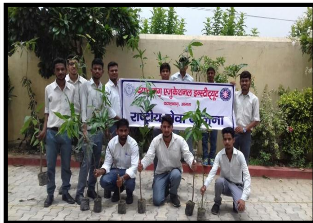
Tree Plantation Program