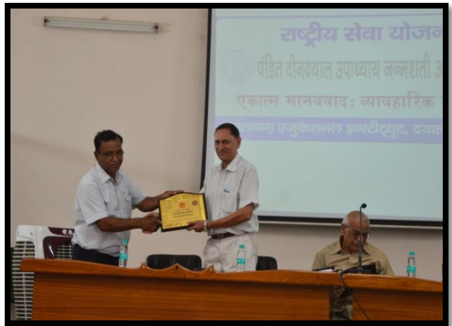
Facilitation of Registrar of the Institute