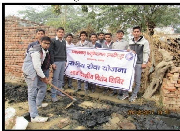
Drains Cleaning in Adopted Villages