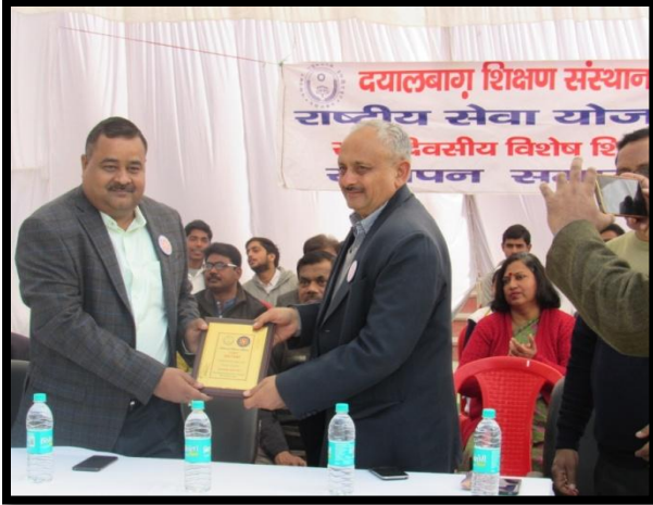
Facilitation of Chief Guest of Valedictory Function