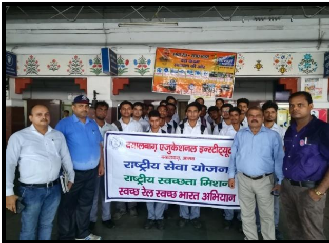
Swachh Rail Swachh Bharat Campaign