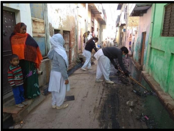
Drains Cleaning in Adopted Slums