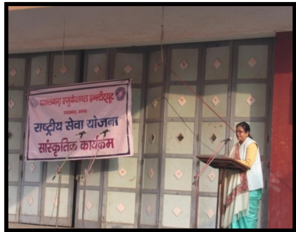
Invited Talk on Women Empowerment