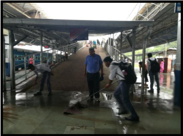
Cleaning at Agra Cantt. Railway Station