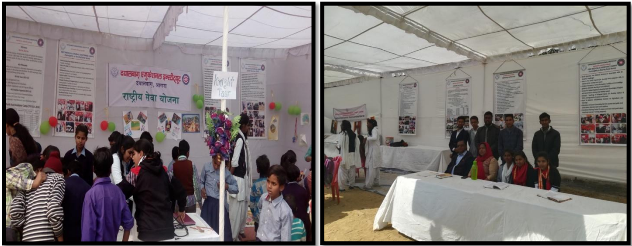
Visitors at NSS Exhibition on Founder's Day

Apart from this, NSS Volunteers also organized Social Awareness Program on Cleanliness/ Cashless Transaction and also on Voters Awareness for Visitors on the occasion of Founder's Day.