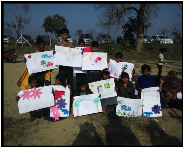
Children Recreation Services