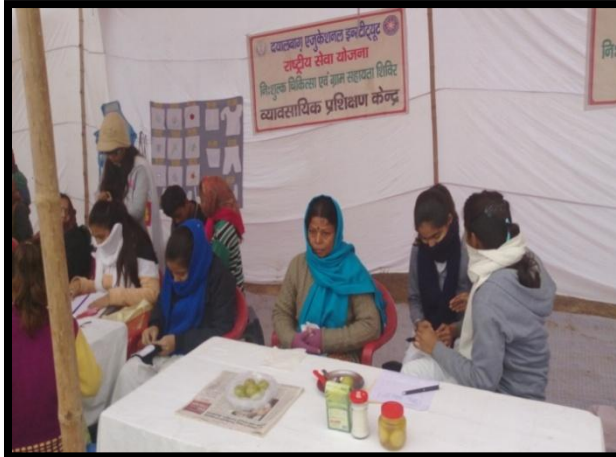
Vocational Training (Pickle Making)