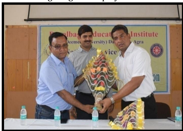
Welcome of Chief Guest