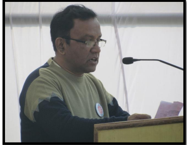
Address by Coordinator, NSS