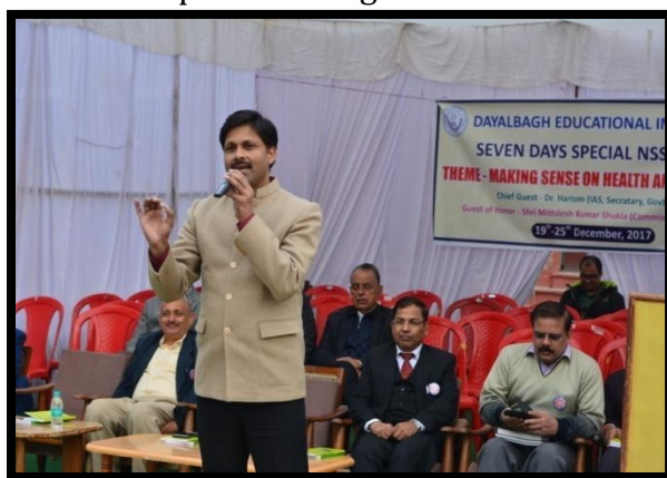
Inaugural Address by Chief Guest