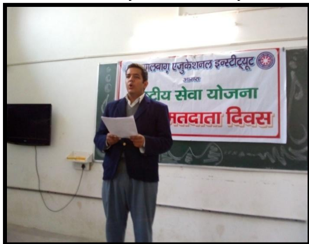
Inter-faculty Speech Competition