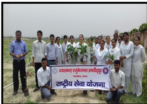
Tree Plantation Program