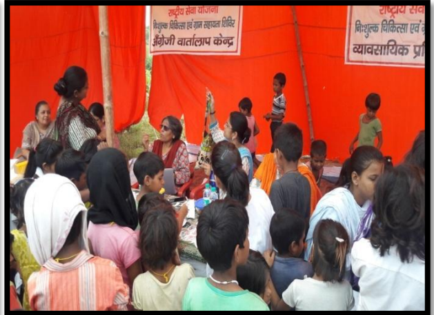
Vocational Training (Textile Printing)