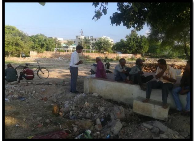
Swachhata Awareness Campaign in Slums