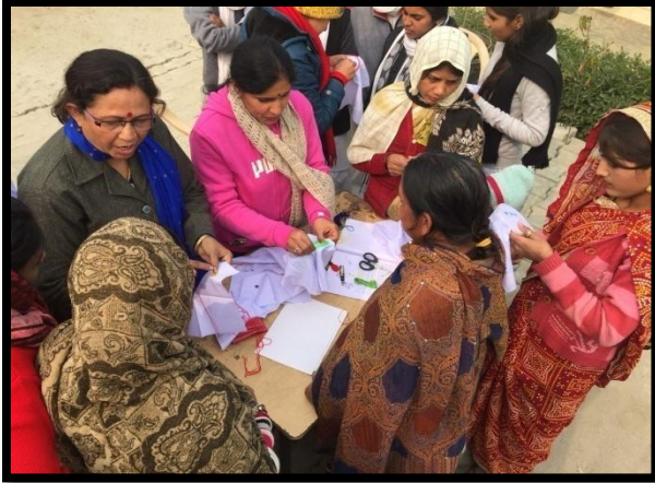
Vocational Training in Adopted Slums