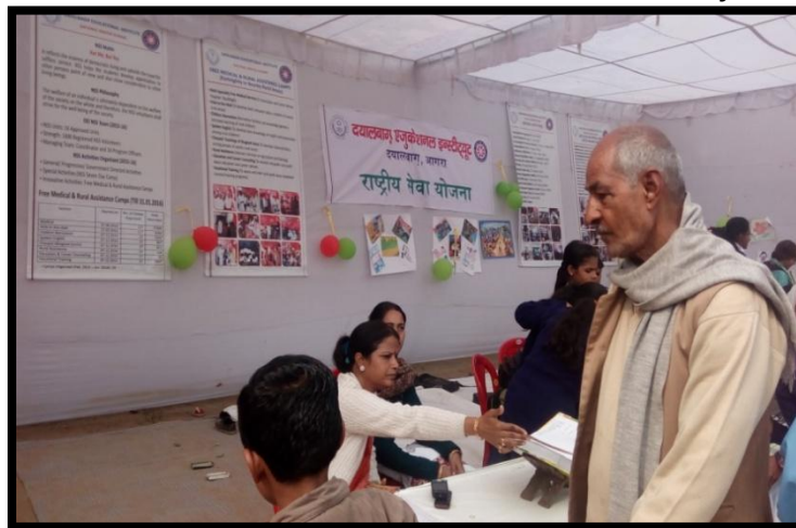
Visitors at NSS Exhibition on Founder's Day