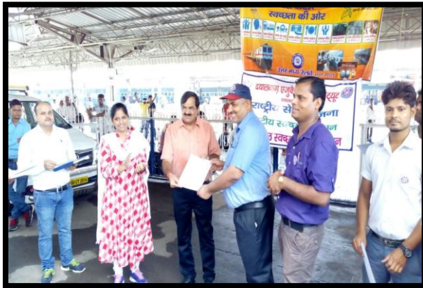
Award to NSS POs