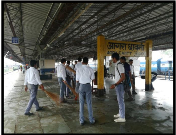
Cleaning at Agra Cantt. Railway Station