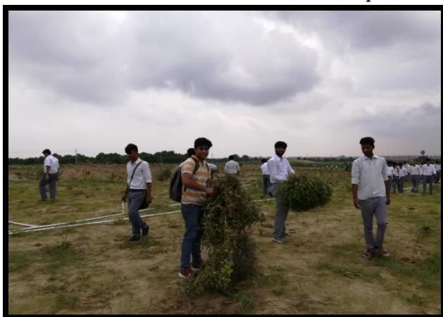
Cleaning of Institute's Orchard