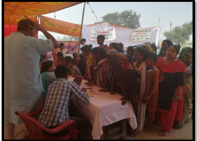
Free Pathology & Medicine Distribution