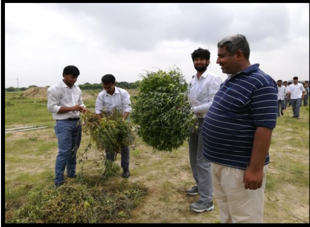
Cleaning of Institute Orchard