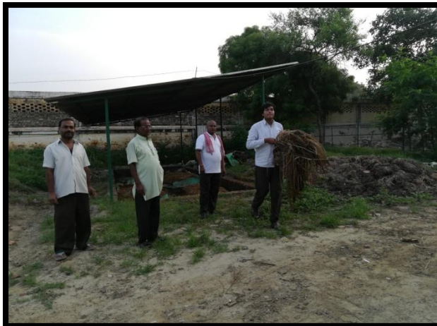
Shramdaan at Bio-Gas Plant