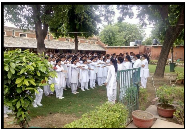
Van Mahotsav Oath Ceremony