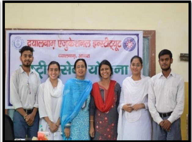
Inter-faculty Speech Competition Winners