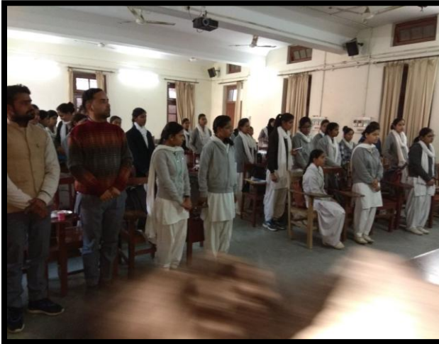
Attendees of Invited Talk