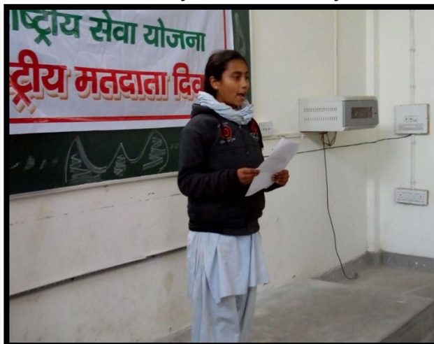
Inter-faculty Speech Competition