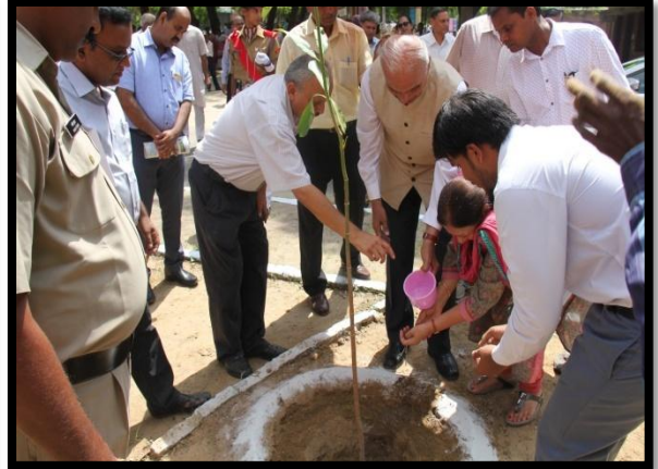
Plantation by Invitees