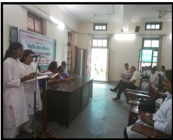
Inter-faculty Speech Competition