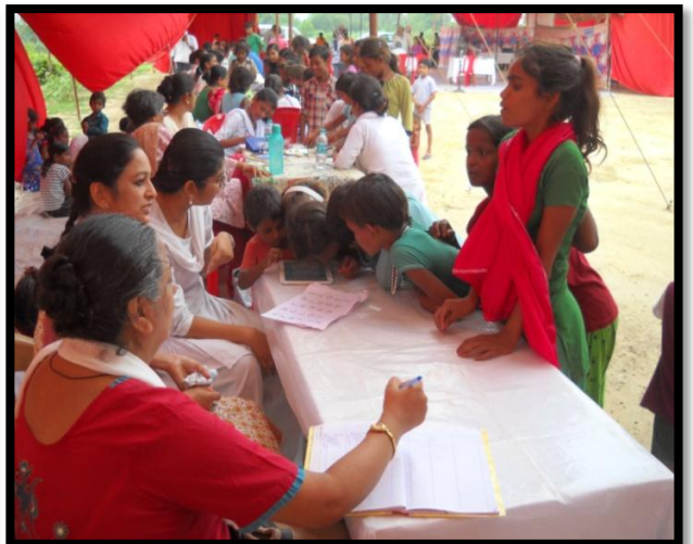
English Speaking Services