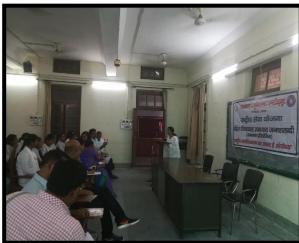
Inter-faculty Speech Competition