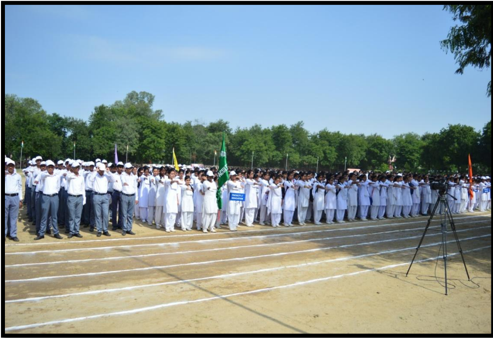
New India Pledge by NSS Volunteers

In compliance of the instructions of the Ministry of Human Resource Development, Government of India, New Delhi and the Regional Director, NSS, Lucknow, the NSS Cell of the Institute organized “New India Pledge” on 15 th August 2017 at 9.30 am at Playground of Faculty of Science. The students and staff of all the faculties and colleges, including authorities of the Institute participated in this program.