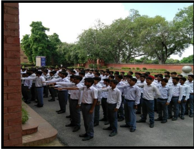
Sadbhavna Oath Ceremony