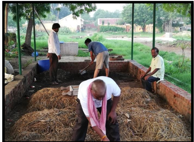
Shramdaan at Wormy-Compost Plant