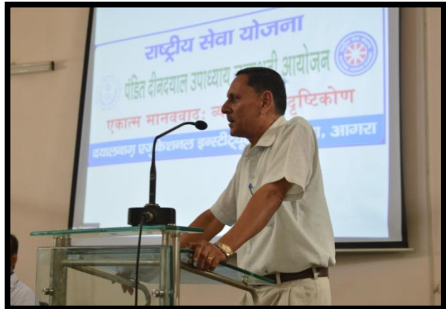
Address by Registrar of the Institute