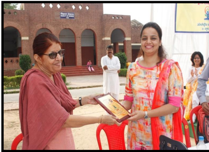
Facilitation of Invited Speaker