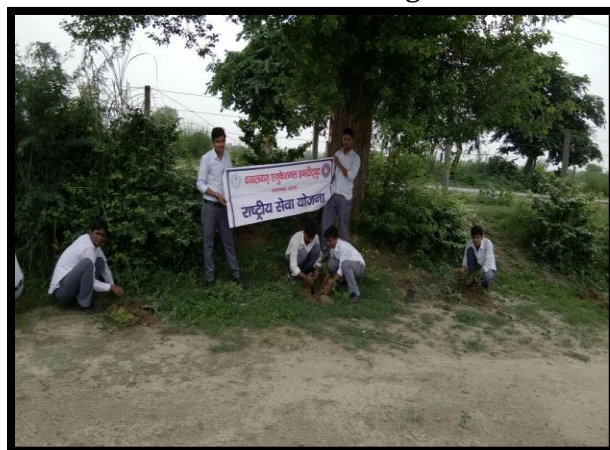
Tree Plantation in Nearby Villages