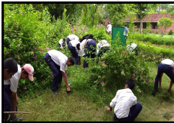
Tree Plantation in the Campus