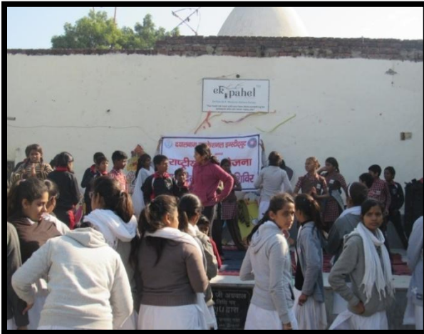
Children Awareness through Recreation