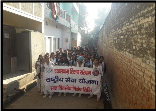
Jan Jagran through Rallies