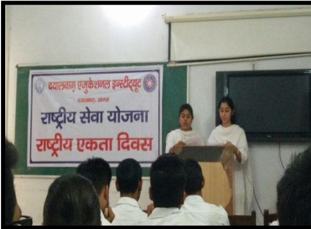
Inter-faculty Speech Competition