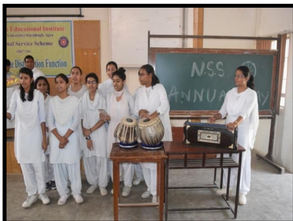
Lakhay Geet by Volunteers