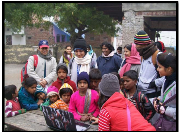
Hole-in-the-Wall in Adopted Slums