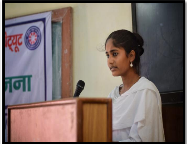
Inter-faculty Speech Competition