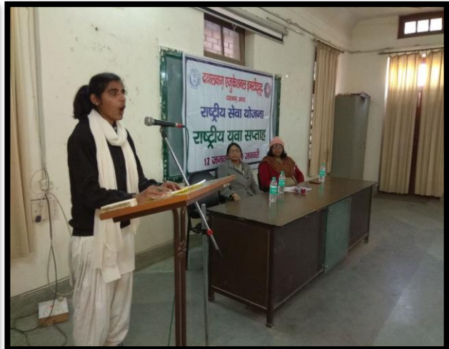
Inter-faculty Speech Competition