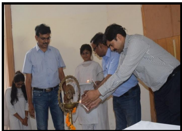
Lighting of Lamp by Guest