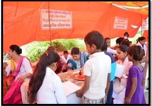
Free Medical & Assistance Camp on NSS Day