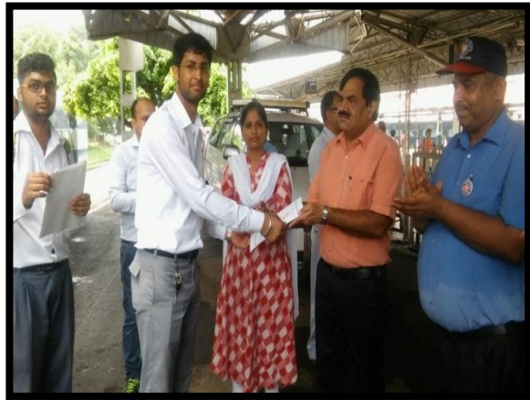
Award to Volunteers