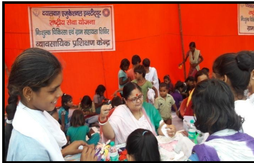
Vocational Training (Stitching)