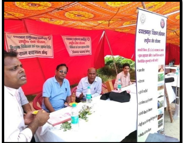
Agriculture & Dairying Services