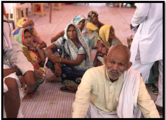
Free Medical & Assistance Camp on NSS Day