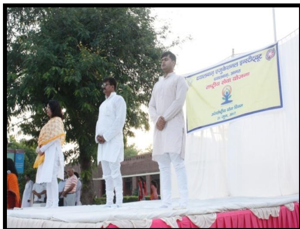
Institute Prayer and Lakshay Geet