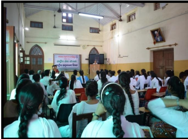
Inter-faculty Speech Competition