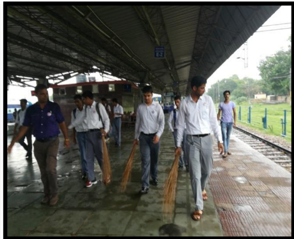
Swachhata at Agra Cantt. Railway Station