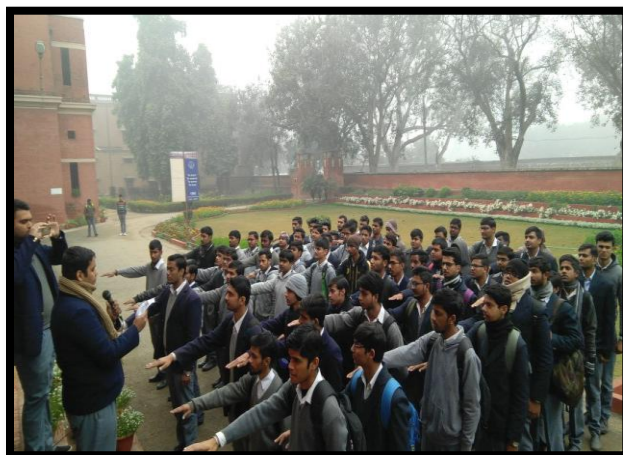
Voters Day Oath Ceremony

On this occasion, in the evening session of 23rd January 2018, an Inter-faculty Essay Writing Competition was organized. On 25th January 2018, after Morning Assembly, the NSS Cell of the Institute Organized Voters Oath Ceremony for all Students and Staff of the Institute. In the afternoon session an Inter-faculty Speech Competition on the topic "My Vote Does Not Matter" was organized.