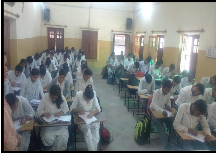
Poster and Slogan Writing Competition

World AIDS Day was observed on 1st December, 2017. On this occasion NSS volunteers participated in Discussion Program and Inter-faculty Poster and Slogan Writing Competition on “Causes, Effects and Precautions to Control AIDS”.