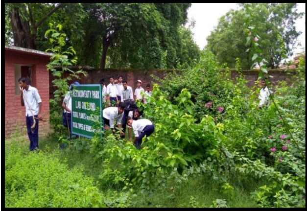
Plant Maninenance in Botanical Garden