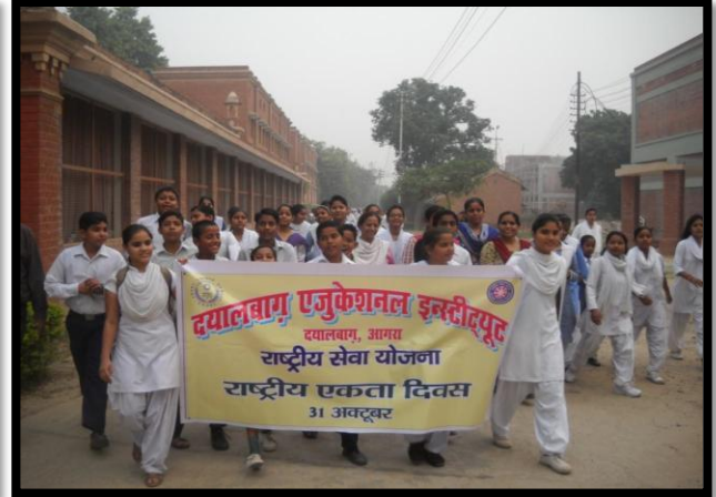
Run For Unity