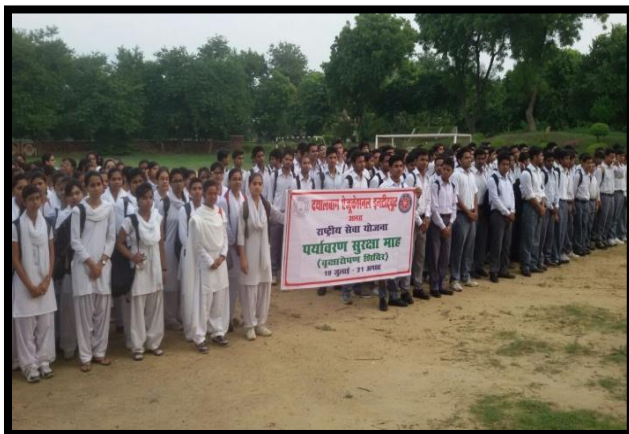
Environment Protection Sankalp