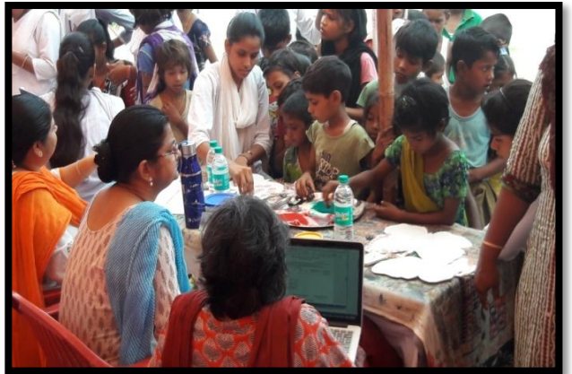
English Speaking Services