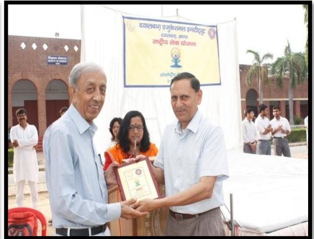
Facilitation of Invited Speaker