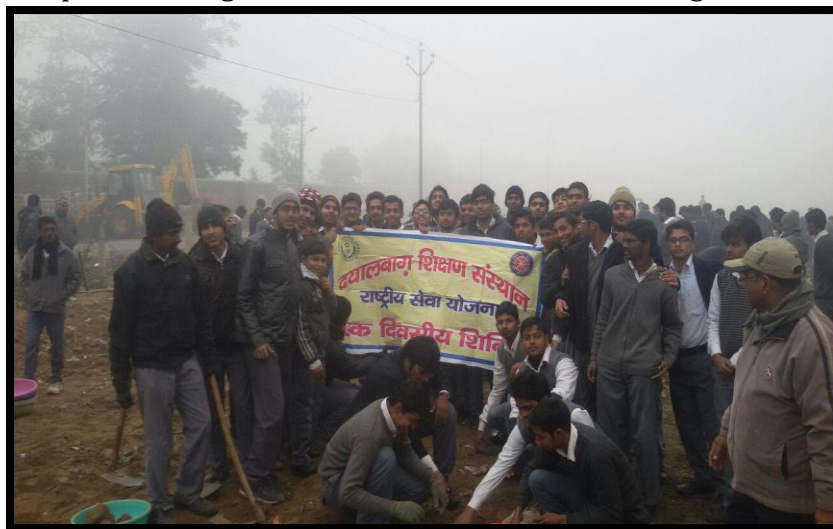
Cleaning in Adopted Areas