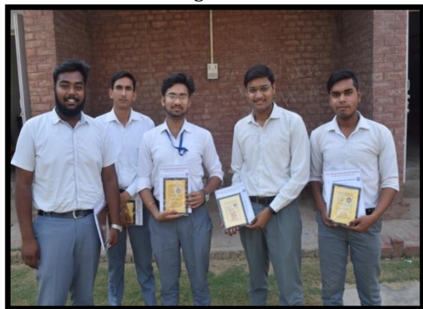
Winners of NSS Events