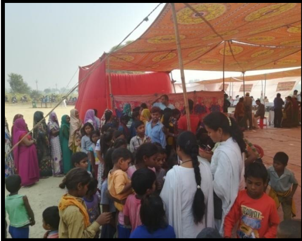
Beneficiaries Queue in FMAC