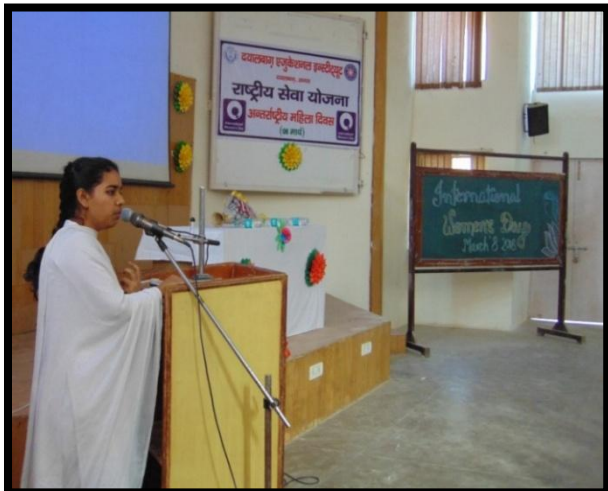
Inter-faculty Speech Competition