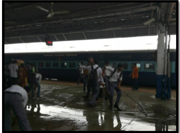
Shramdaan at Agra Cantt. Railway Station