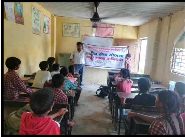
Swachhata Awareness to Children