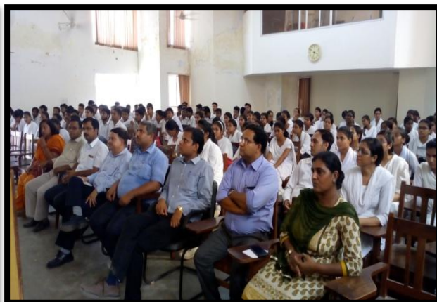
Attendees of International Ozone Day