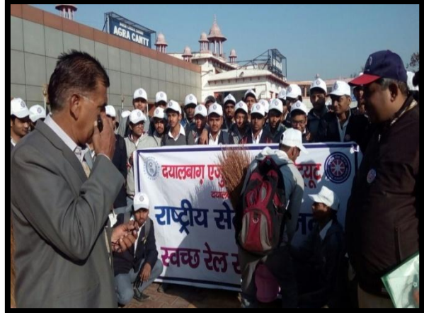
Swachhata Campaign at Agra Cantt.