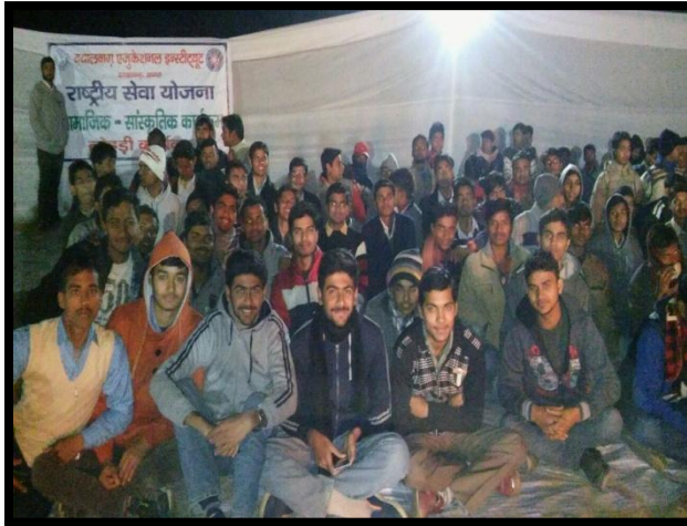
Attendees of Socio-Cultural Program

The Volunteers and staff of NSS Cell of the Institute organized Shramdaan Activities on 11th and 12th January 2018 involving NSS Volunteers of different Faculties in Girls Hostels and Play Ground near DEI Stadium (Opposite Faculty of Engineering). On these dates, volunteers also organized Social Awareness Program on various social issues including Cashless Transaction in nearby localities. On 13th evening, Volunteers and staff of NSS Cell organized Socio-Cultural Program and Camp Fire in Girls Hostels and Play Ground near DEI Stadium.