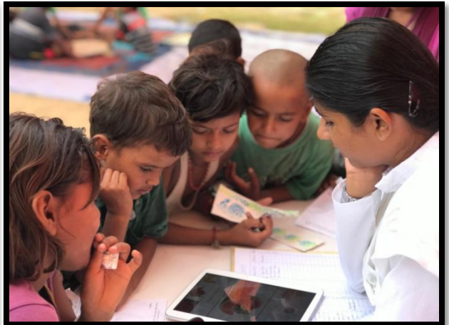
Free Medical & Assistance Camp on NSS Day