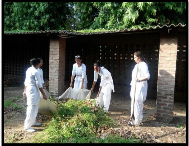
Cleaning at Gaushala