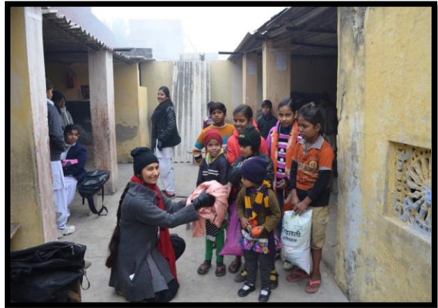
Social Help-Old Cloth Distribution