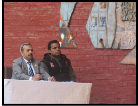
Speech Competition & Invited Talk on AIDS