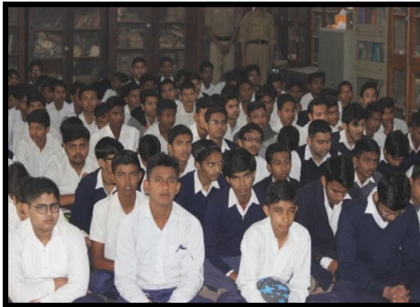
Attendees of Invited Talk