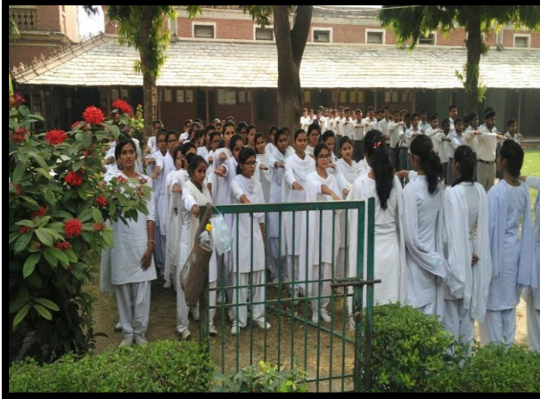
Unity Day Oath Ceremony

National Unity Day was observed on 31st October 2017 on the Birth Anniversary of Sardar Vallabh Bhai Patel. On this occasion, the NSS Volunteers, Students and Staff enthusiastically participated in National Unity Oath Ceremony organized in various faculties by the NSS Wing of the Institute. In the evening session, NSS Volunteers of various faculties participated in Inter-faculty Speech Competition on the topic “Role of Youth in Nation Building” organized in Faculty of Social Sciences.