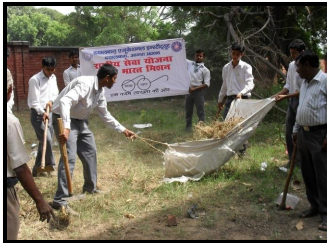
Cleaning of Surroundings