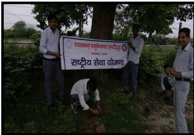
Tree Plantation in Nearby Locations