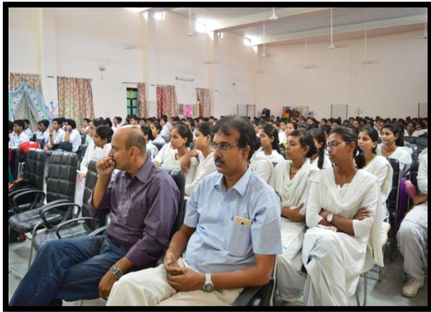
Attendees of Invited Talk