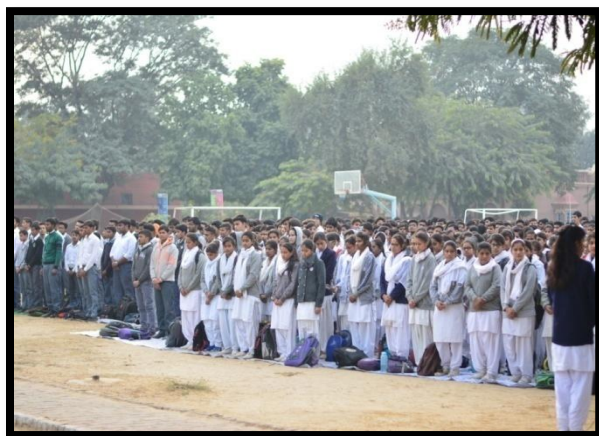
Campers in Inaugural Function